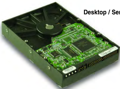
Desktop / Server Hard Drive