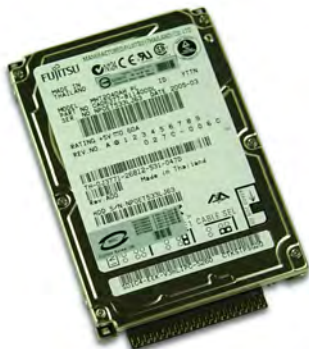
Laptop Hard Drive